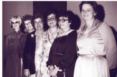
The original Wheathearts in 1979.

It's easy, fun and worthwhile. Just bake one of your favorite recipes and share it with someone you care about in your community. Enclosed are a few recipes we hope you'll enjoy.